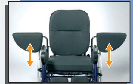
Removable armrests which can be adjusted in height.