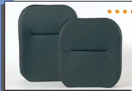
Back - high : 60 cm (to order) Back - low : 50 cm (standard version)