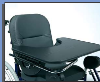
- Collapsible table (B12)