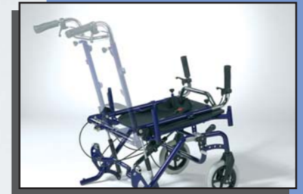
Removable back, seat and wheels ease the transport of the wheelchair.