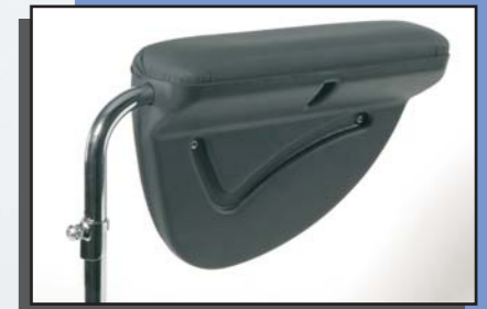
Standard removable armrests (not adjustable in height).