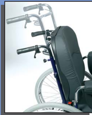
Pushing handles adjustable in height.