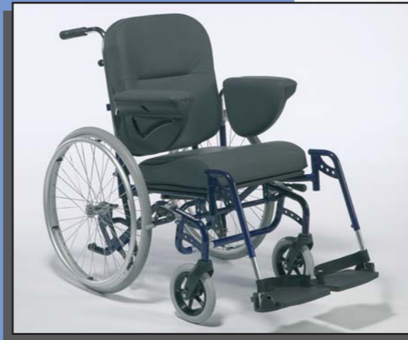
The legrests are fully adjustable and the footrests with inclination will result in an ideal angle for the feet at any given time.