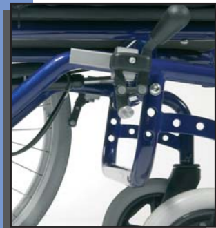
Seating height adjustable in 3 positions