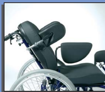
- Side support