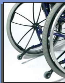
- Anti-tipping - Spiderwheels